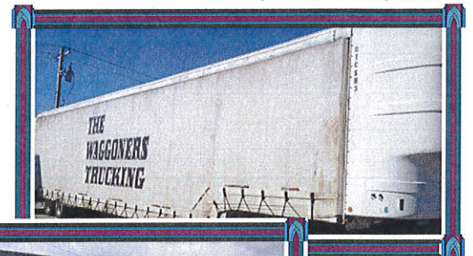
Before trailer modification