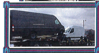
After trailer modification